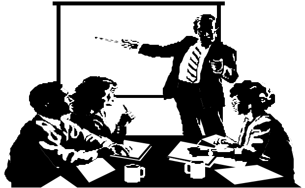
Let's get down to business!